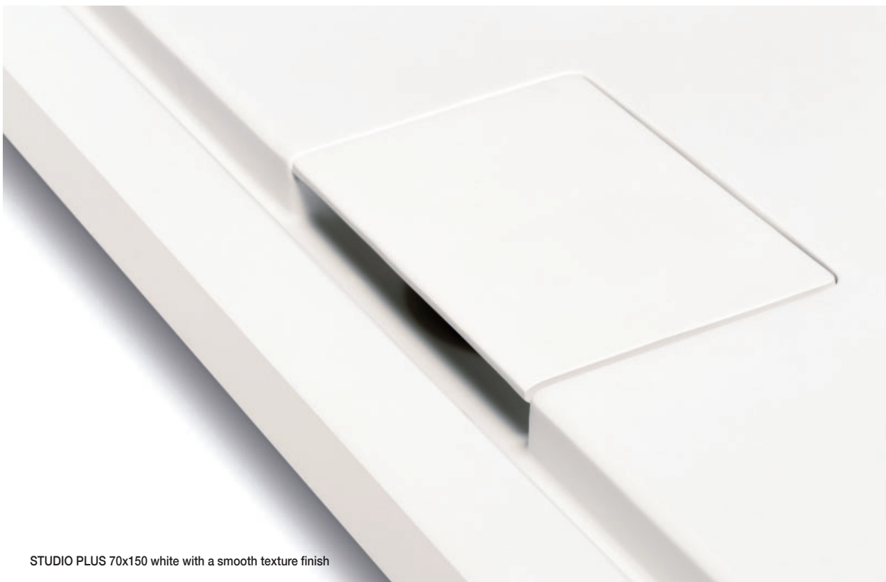
STUDIO PLUS 70x150 white with a smooth texture finish