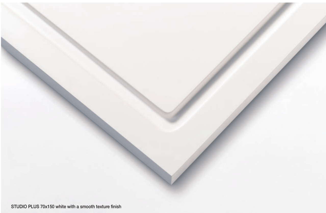
STUDIO PLUS 70x150 white with a smooth texture finish